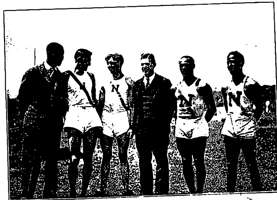
DETROIT NORTHEASTERN HIGH SCHOOL TRACK TEAM 1927-28

State Champions—Class A State Meet Score—32 Points