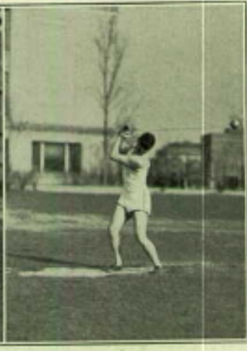
HURD Half Mile—Mile