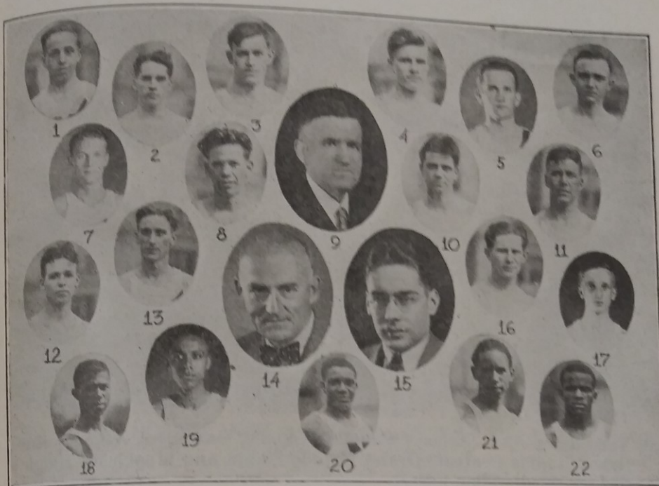
DETROIT NORTHWESTERN HIGH SCHOOL TRACK TEAM 1929-30