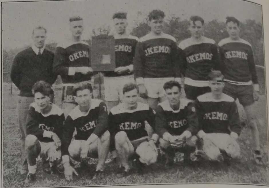
OKEMOS HIGH SCHOOL TRACK TEAM 1929-30 State Champions Class D