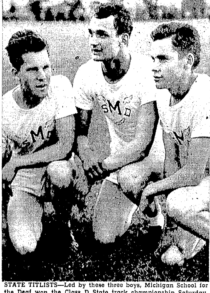
STATE TITLISTS—Led by these three boys, Michigan School for the Deaf won the Class D State track championship Saturday.

Flushing, N. Y.—UP—Slamming Sammy Snead took one leg on the world's golf championship Saturday when he defeated Byron Nelson by one stroke in the first half of their special 72-hole match for the unofficial title.