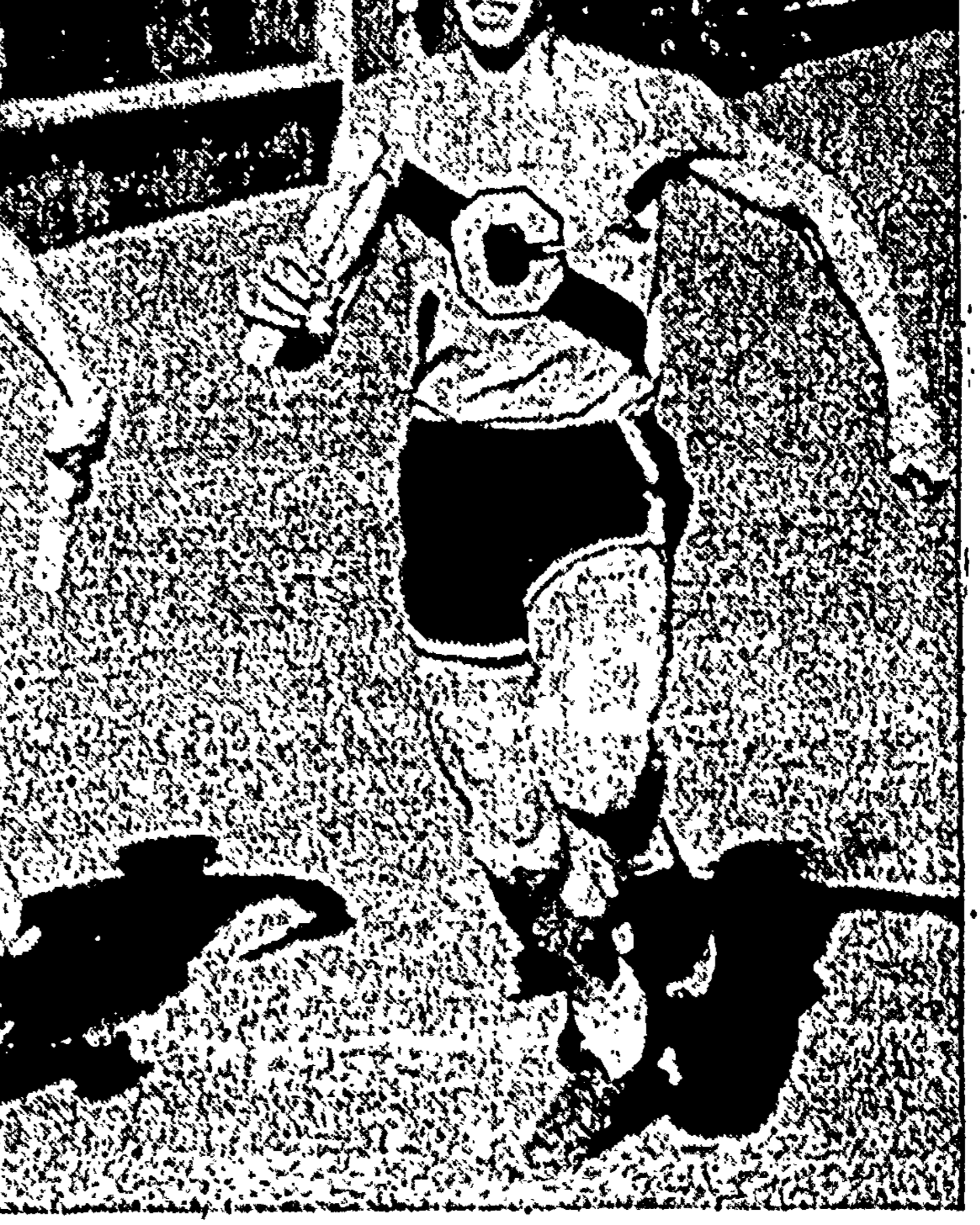
Most Thrilling Race Of Afternoon

Eddie Arcaro was aboard Traffic Judge, but he won't ride him in the Preknexa, for he must handle the Belair Stud's Nashua, who finished second in the Kentucky Derby. This was the sixth Withers victory for Arcaro, putting him far ahead of other jockeys in the stakes being run for the 86th time.