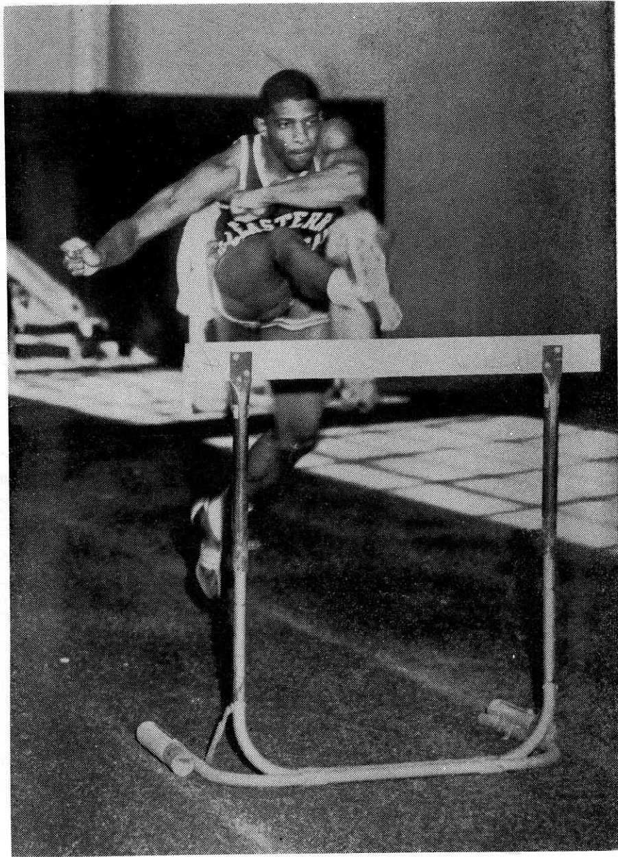
1956 winner of the high and low hurdles in the Huron Relays