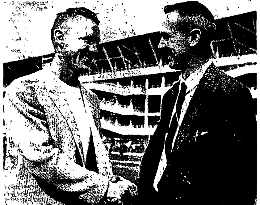
IN ADDITION TO the 880 relay

finish when Central was first and Northern second. Northern's 32 1/2 total was the lowest for a champion in eight years. But on a day when 42 schools shared the points, it was a comfortable figure. Northern accounted for three of the seven first places won by Flint schools.