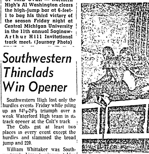
FIRST OVER — Dalton Kimble (third from left) is first across the last hurdle and first to the finish line in wipping the 65 low hurdles Friday night at Mount Pleasant. The Northern flash won two events and accumulated 14 1/2 of