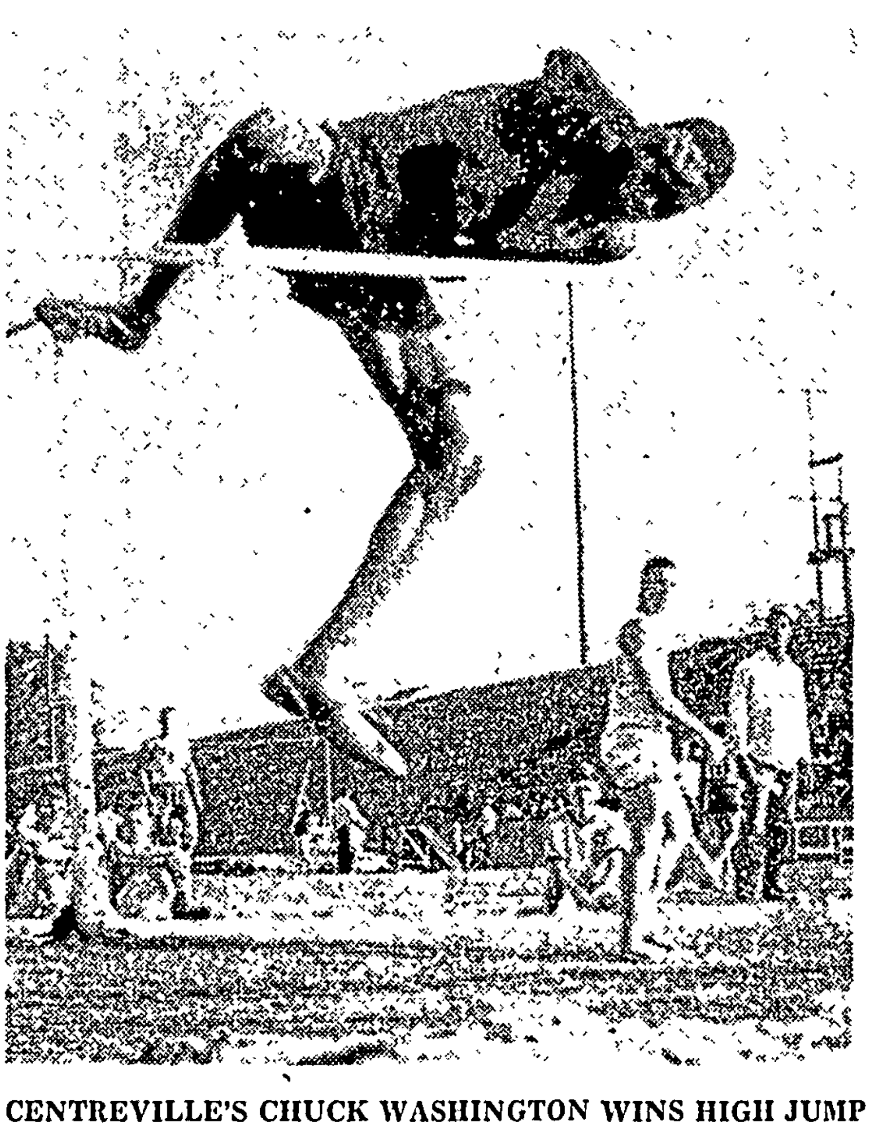
He Repeats in Champions' Meet with Record 6-31/4 Leap