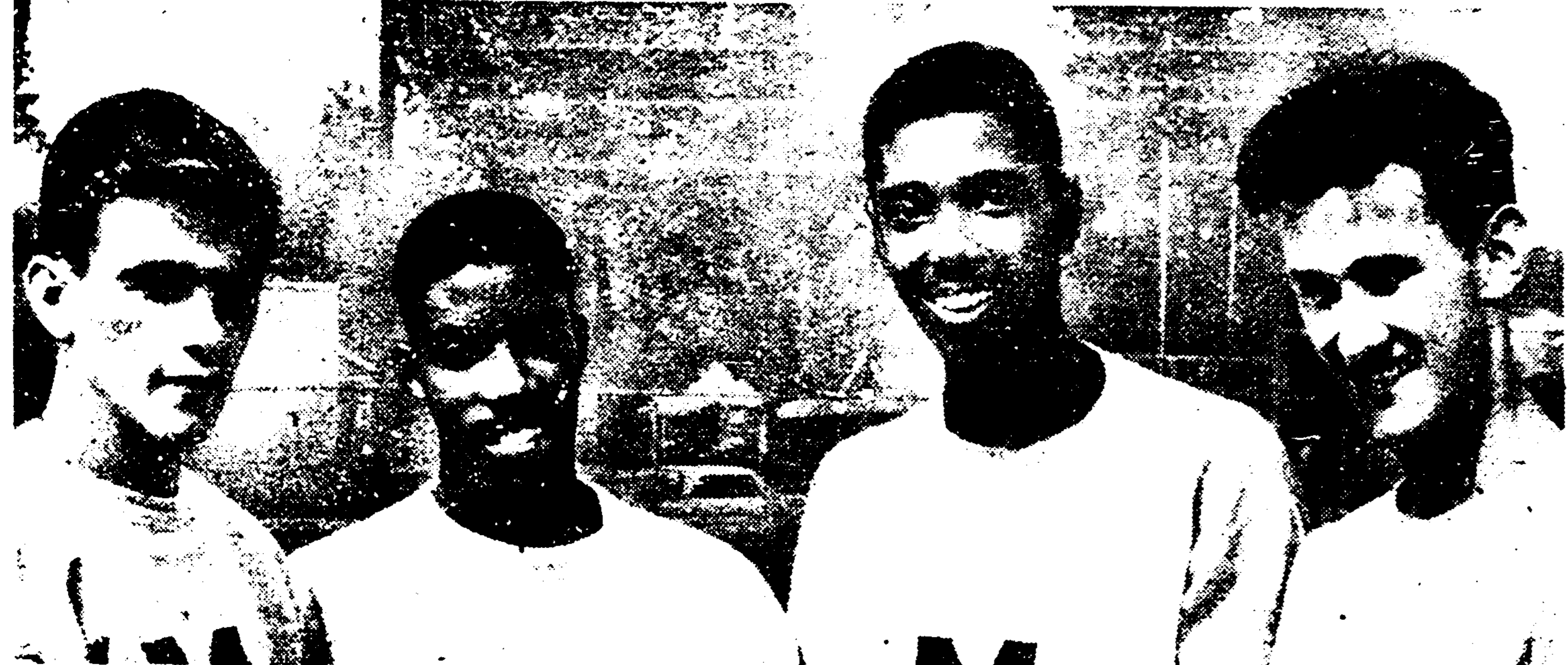
MILE RELAY CHOICE—This quartet of runners from Mackenzie, who comprise that school's mile-relay team, have been awarded a place on The Detroit News all-state team. They share the state