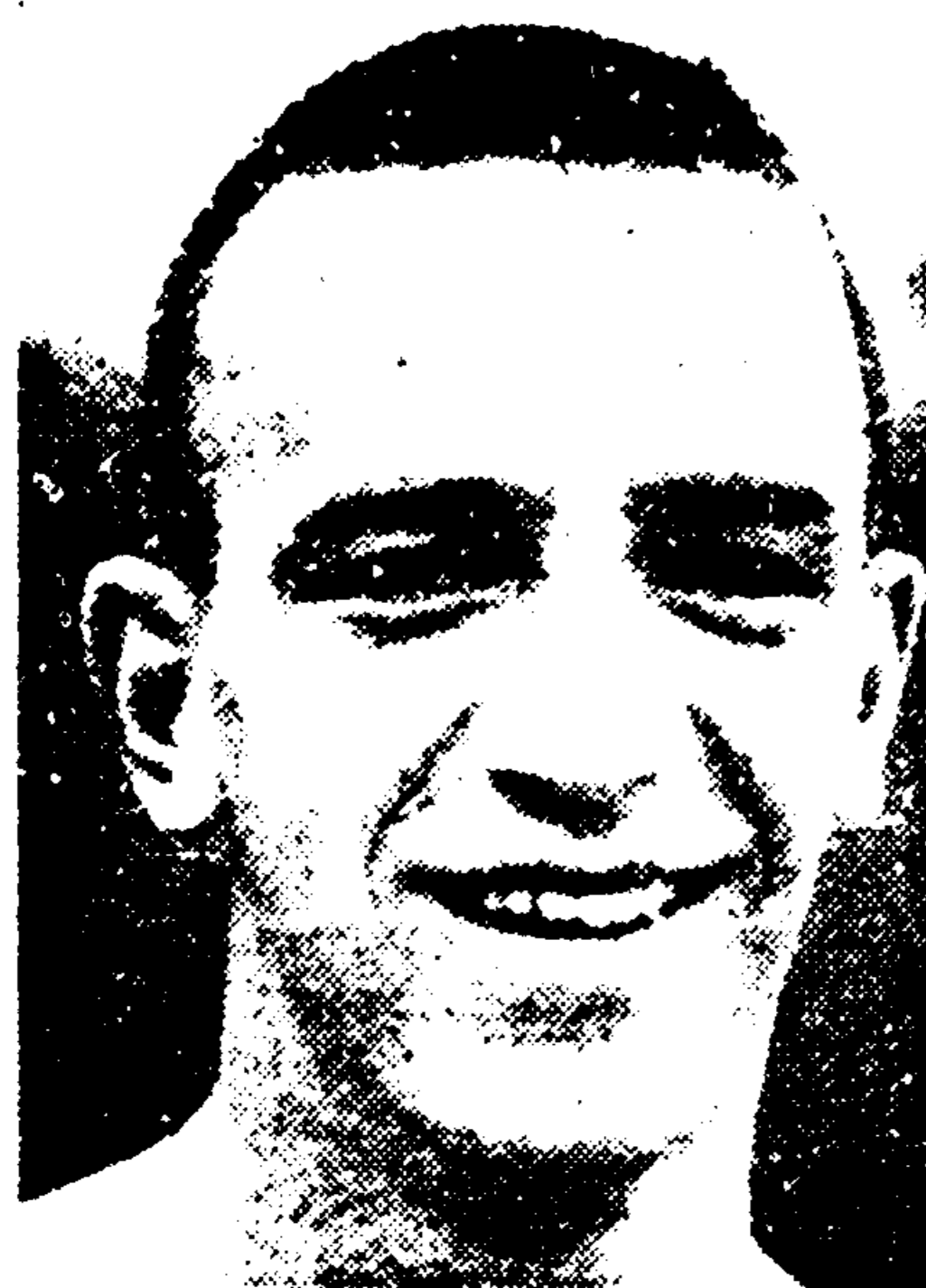
DAS CAMPBELL Low Hurdles