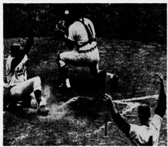
THE BALL WAS LATE

WASHINGTON (AP) — The Washington Senators bopped on Moecky Lolich for four straight hits with nobody out in the second inning Saturday and went 4-1 to defeat the Detroit Tigers at Fenway Park.