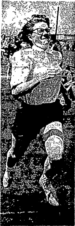
Kay Stasiak Triple Ainsworth Winner