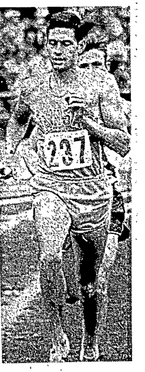
Jim Ryun Great Anchor Leg