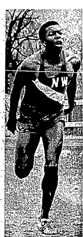
Al Holland City Mile Champ