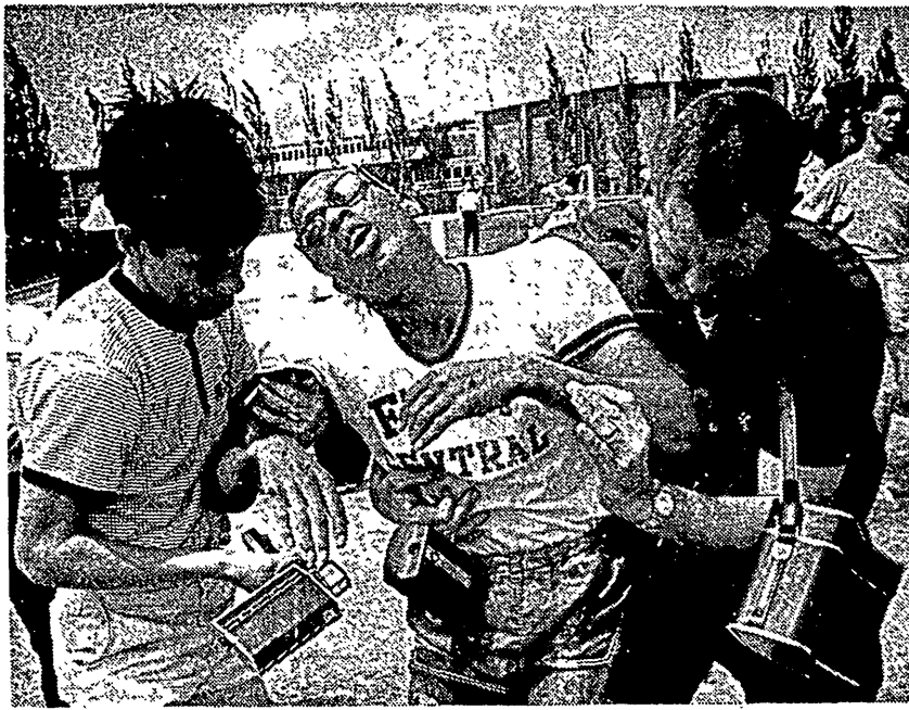
He's Helped by Unidentified Spectators