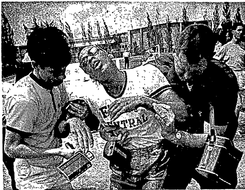
He's Helped by Unidentified Spectators