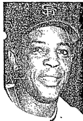
Willie Mays Socks 591st Homer

★ ★ ★ In other National League action Friday, Atlanta tripped Montreal 7-5 in 12 innings, Philadelphia took San Francisco 3-1,