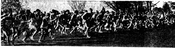
A Total Of 144 Runners Begin The 2½-Mile Race For The Class C-D State Championship