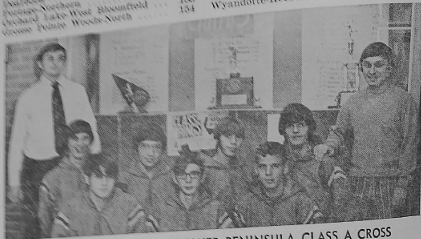
FLINT-KEARSLEY—1972 LOWER PENINSULA CLASS A CROSS COUNTRY CHAMPIONS