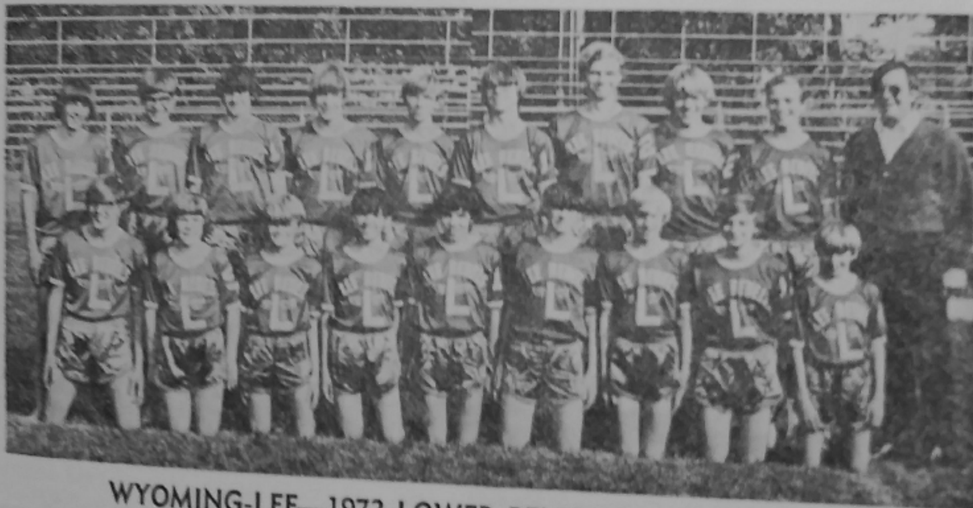
WYOMING-LEE—1972 LOWER PENINSULA CLASS C-D CROSS COUNTRY CHAMPIONS