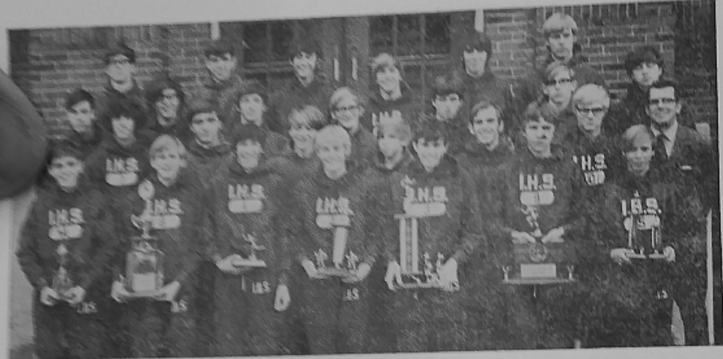
ISHPEMING—1972 UPPER PENINSULA CLASS A-B CROSS COUNTRY CHAMPIONS