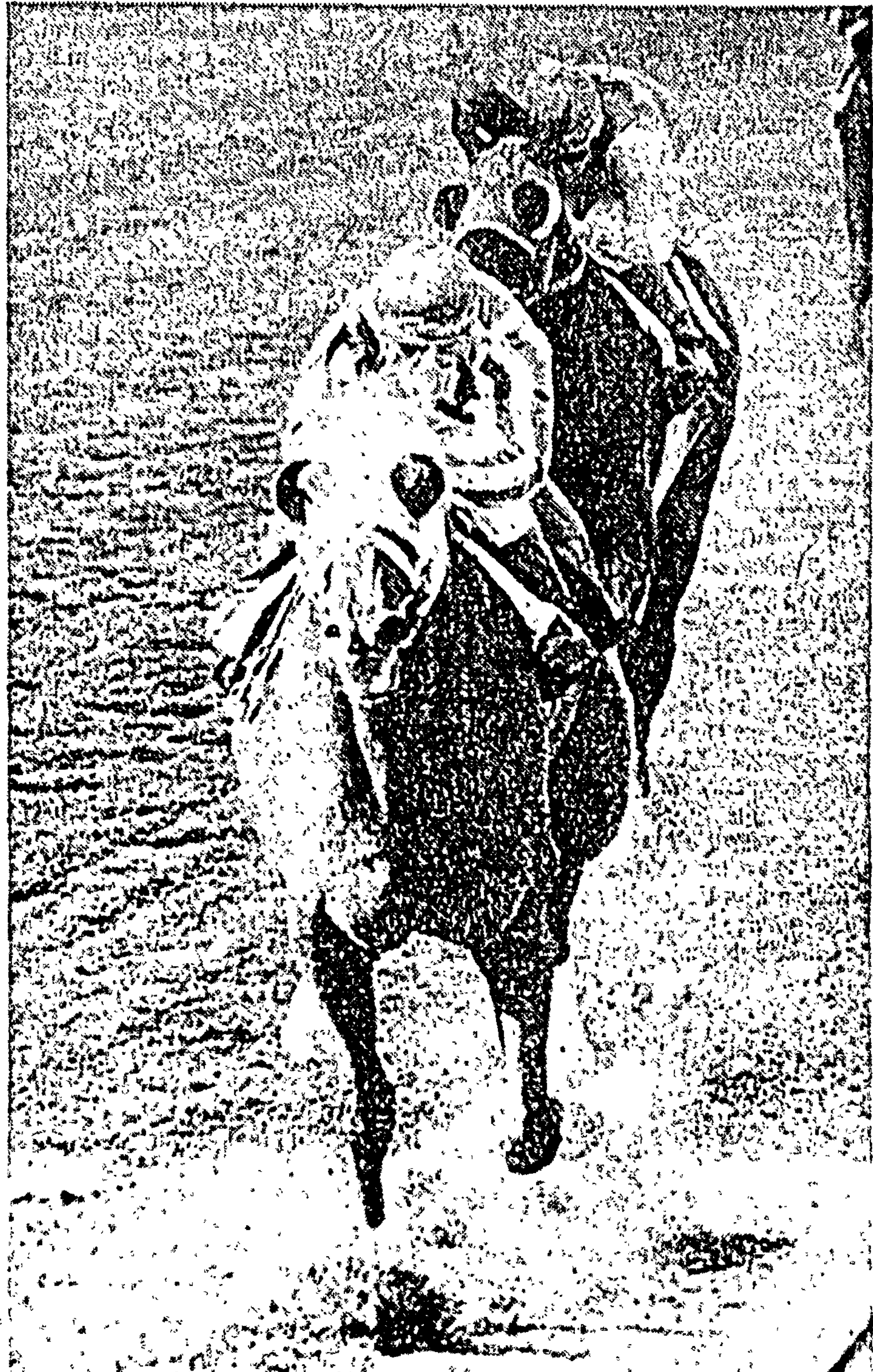
HEADING HOME — Secretariat, with jockey Ron Turcotte up, leads Sham, ridden by Laffit Pincay, to the finish line to win Saturday's 98th Preakness Stakes. Story on Page F-2.