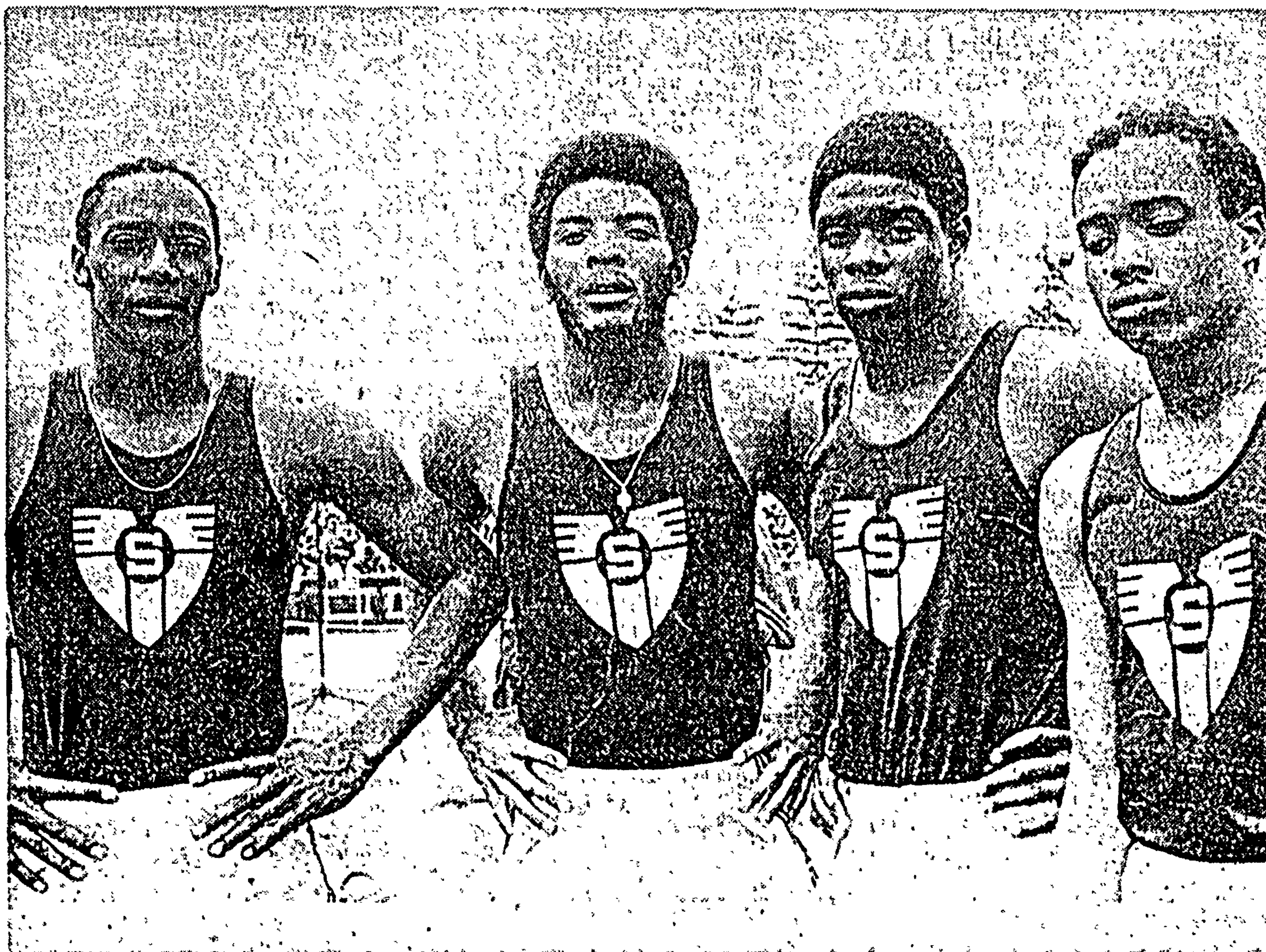
Saginaw High's Victorious 880-Yard Relay Foursome

"No one could ask for a bigger thrill, and a better thing to happen for such exceptional athletes. I didn't expect it because