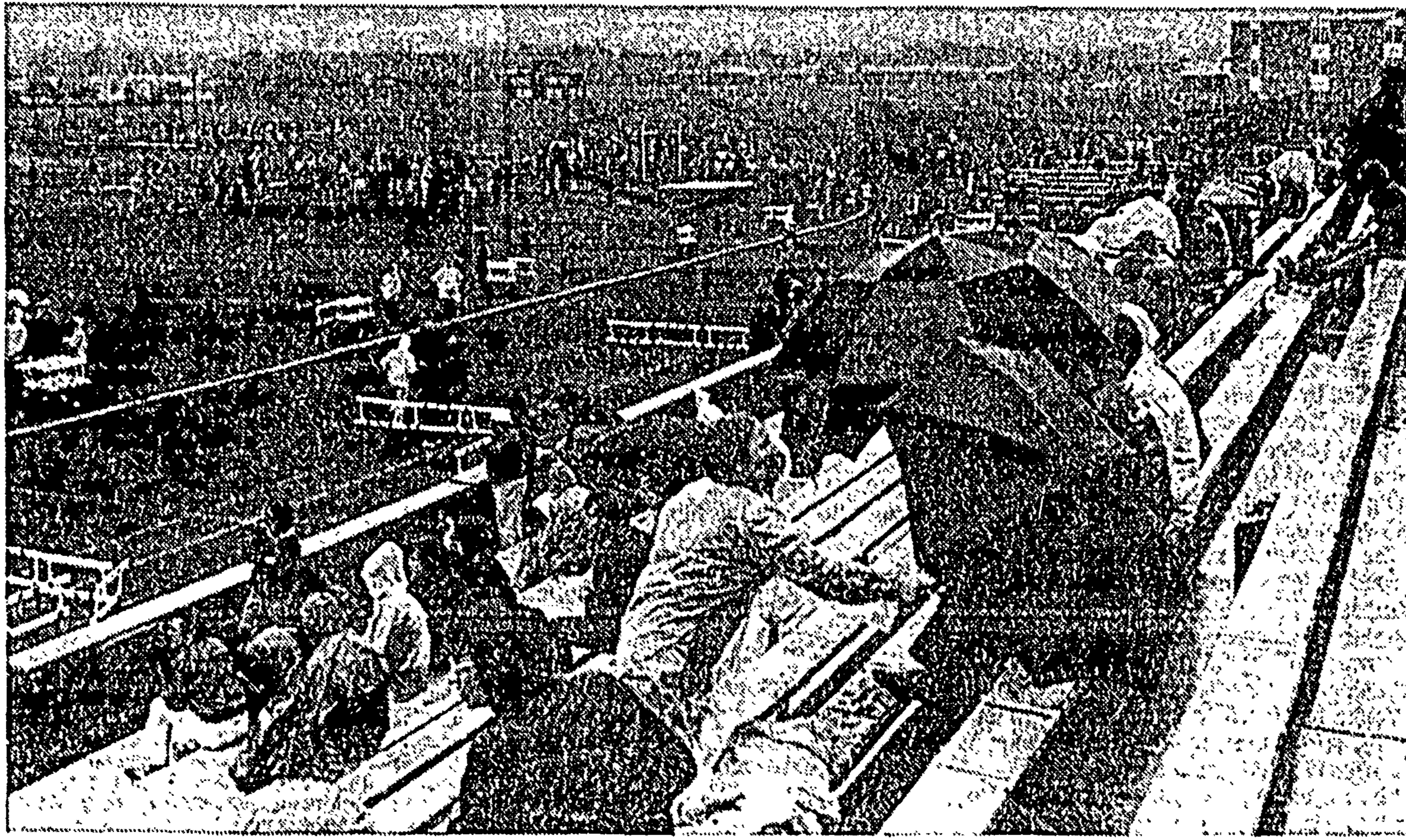
WET DAY FOR TRACK —You can always tell when a sports fan is more than a fan. Just look around at the spectators braving the cold wind and rain at Monday's eighth