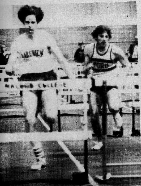
Lakeview won the 60 yard high hurdles in

Mount Clemens also set a record with a 3:28.51 clocking, which shattered the old mark by nearly five seconds.