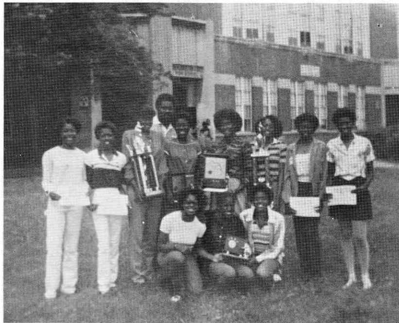
NO NAMES AVAILABLE