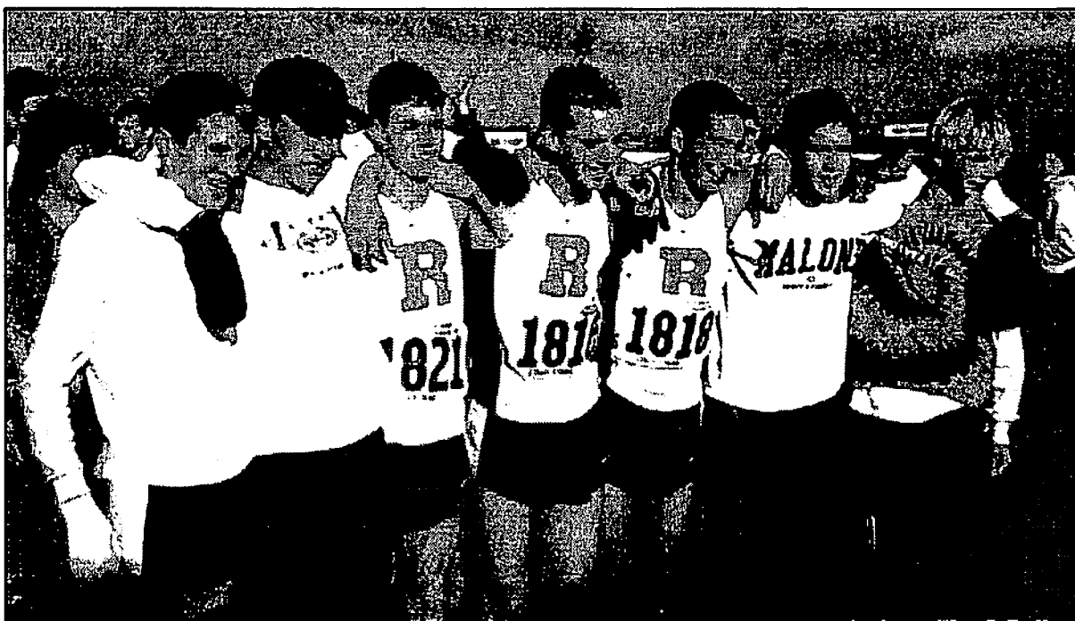
After three straight runner-up finishes, Rockford's young men celebrated their triumph.