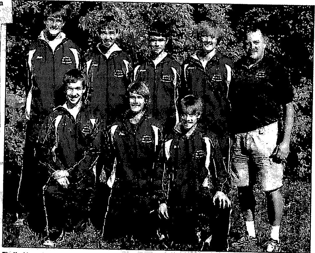
The Novi boys cross country team stands together after winning the KLAA Central Division meet.